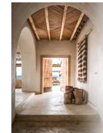
From top: the Belvedere Hotel, home to Matsuhisa Mykonos; the ancient ruins of Delos, the mythical birthplace of Apollo and Artemis; Scorpios, one of the island's coolest beach clubs