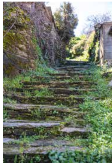
Top, middle: Otzias Bay. Top, right: a theatre in the ancient city of Karthea. From above: the new One&Only luxury resort; old stone steps in the capital city of Ioulis; an ancient carved stone lion

BEST BY BOAT: Drop anchor in the port of Vourkari, a convenient first stop if you are meeting your yacht in Athens.