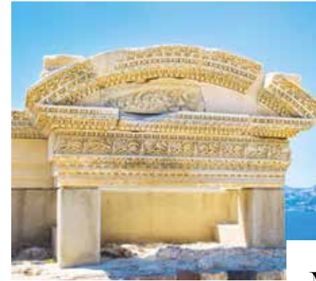
Right: an Ancient Roman theatre built around the third century BCE; Right, middle: the white cliffs on Sarakiniko Beach. Below: octopuses hung out to dry in the village of Mandrakia