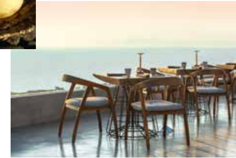
Above: Santorini aubergines. Right: Opson Restaurant at the Andronis Arcadia hotel. Far right: a typical church in Oia village