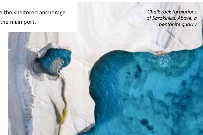
Chalk rock formations of Sarakiniko. Above: a bentonite quarry